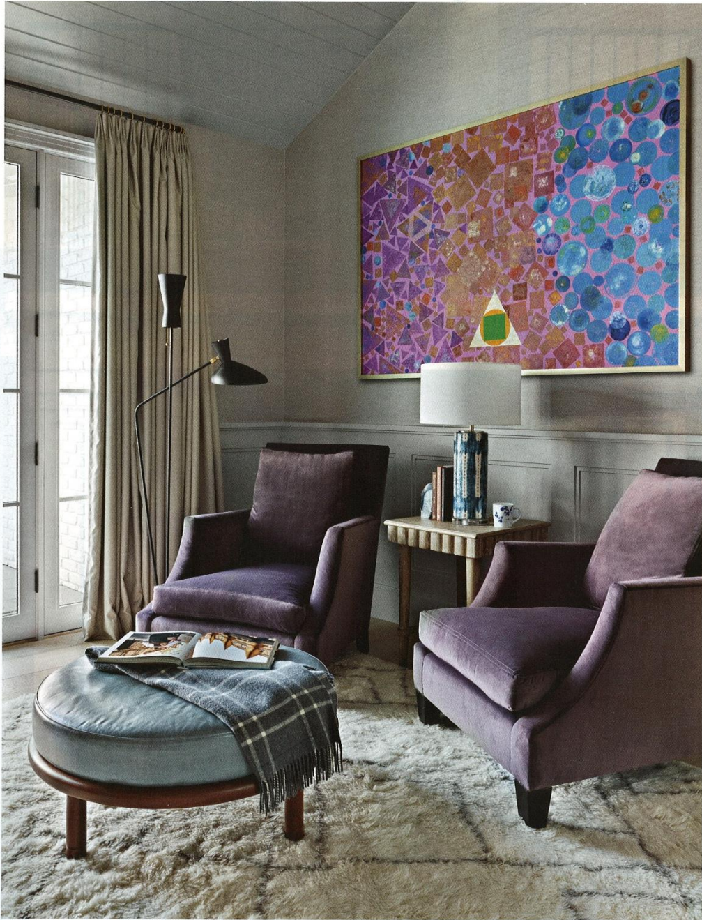
Envisioned as a quiet retreat, the primary suite's seating area features chairs upholstered in Pindler's Voltaire Mink. They are joined by a Wisteria side table and Lawson-Fenning's Moreno ottoman covered in Moore & Giles leather. The artwork is by the homeowner's late father.