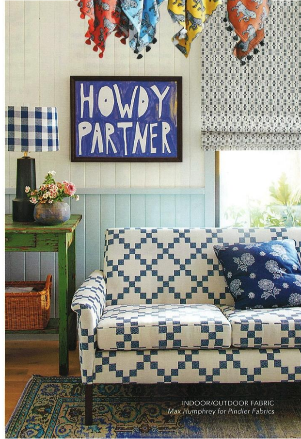
INDOOR/OUTDOOR FABRIC Max Humphrey for Pindler Fabrics