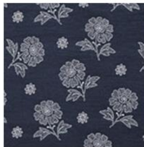
7461– Bandana, Color Indigo