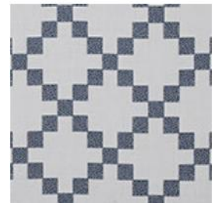
7462– Quilt, Color Denim