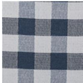
7458– Gingham, Color Denim