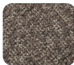
7335 Plush Greystone