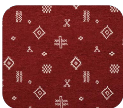
7305 Enola Madder