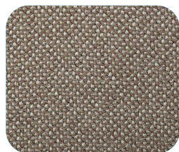
7557 Saybrook Mink