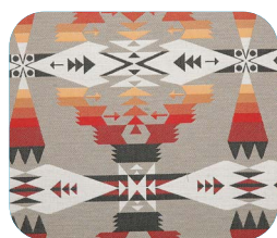
6909 Tucson Hawk

Bold colors mimic the red and orange sunset of a fall sky, while geometric patterns pay homage to exquisite native textiles.