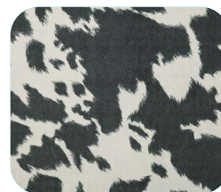
P6520 Cowhide Grey

Exclusively available through Pindler 800.669.6002 | pindler.com | To The Trade