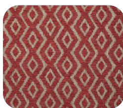
7326 Cavalli Cayenne