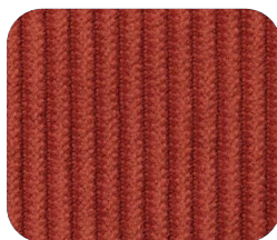
7746 Corduroy Cinnamon