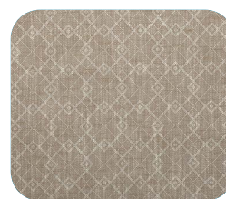
7382 Overbrook Bark