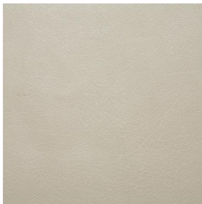
Ottoman Fabric: 1012– Barstow, Color Ash