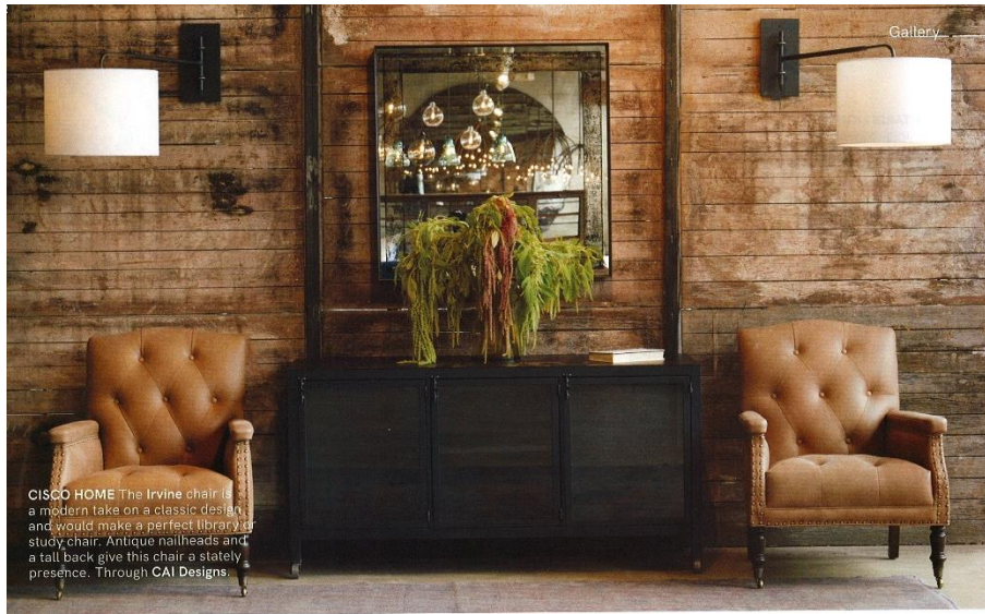
CISCO HOME The Irvine chair is a modern take on a classic design and would make a perfect library or study chair. Antique nailheads and a tall back give this chair a stately presence. Through CAI Designs .