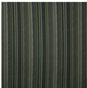
6616— Keating Color Forest