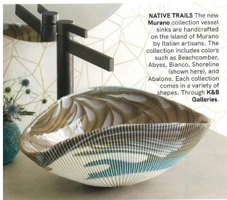
NATIVE TRAILS The new Murano collection vessel sinks are handcrafted on the island of Murano by Italian artisans. The collection includes colors such as Beachcomber, Abyss, Bianco, Shoreline (shown here), and Abalone. Each collection comes in a variety of shapes. Through K&B Galleries .

THE BEST IN DESIGN FROM THE SHOWROOMS OF theMART