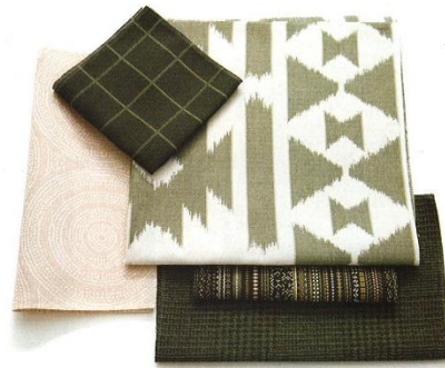
PINDLER Easy-to-clean, anti-microbial fabrics add new level of protection and safety, especially now when fighting germs is top of mind. Pindler offers many options for stylish and functional fabrics for indoor and outdoor use. Shown here, Sunbrella's green blush collection.