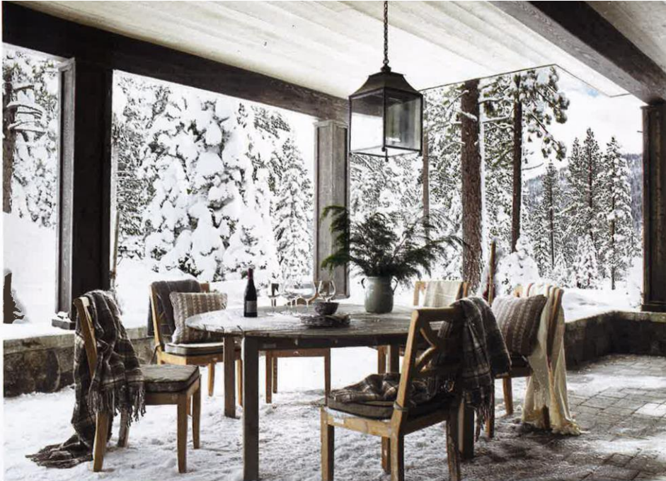
A covered outdoor dining area takes full advantage of Tahoe's relatively mild winters. The dining table and chairs are by Country Casual Teak, the chair cushions are in Perennials fabric, the pillows are in a Jasper stripe, and the pendant is by the Urban Electric Co. The ceiling is sheathed in clear cedar, and the columns are wrapped in stained Douglas fir.