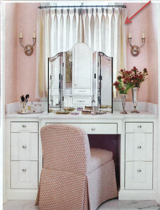
Master bedroom A pink "Dana" ottoman from Tomlinson is studded with nailheads in a floral design. Draperies, pillow shams, and the bench at the foot of the bed are dressed with "Theodore" fabric by Travers from Zimmer + Rohde. Master bath Mary Leyden's vanity table was built into a niche with a north-facing window, providing soft light for applying makeup and grooming.