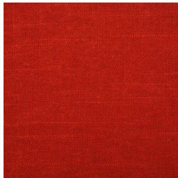
Roman Trim: 8946-Jefferson Color Henna