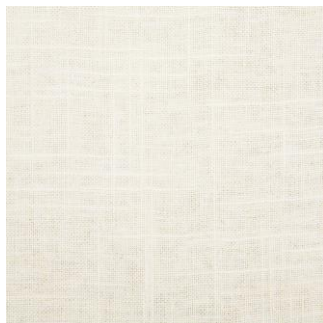
Drapery Trim (Left): 8946-Jefferson, Petal Drapery: (Right) 8946-Jefferson, Ivory