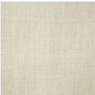
Bed Fabric: (Top) 7726-Bastogne Color Natural