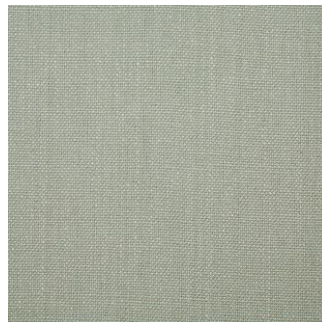
Bench Fabric: (Bottom) 7726-Bastogne Color Natural