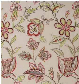
Roman Shade: 3701-Bella Vite, Color Marrakesh