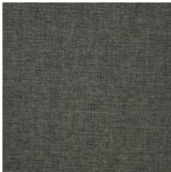
Ottoman: 4478-Ashland, Color Pewter