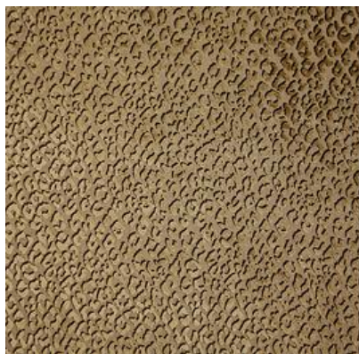
Exclusive Pattern 4862-Pounce, Color Taupe

Don't even try to keep your hands off cut velvet—we certainly can't. The season's new crop of plush patterns, from plucky polka dots to geometric Deco, makes this most-touchable fabric even more alluring, whether for a single pillow or a whole sofa.