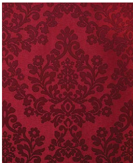
7298 – HUGO: RUBY