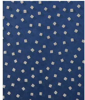
7295 – SILAS: SAPPHIRE