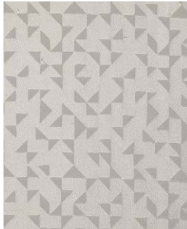
7296 – JASPER: CHAMPAGNE