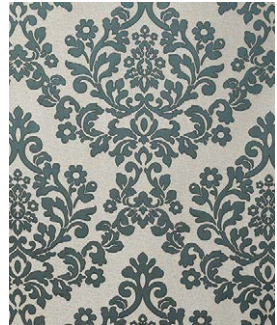
7298 – HUGO: EMERALD