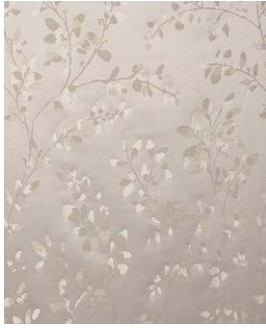
7297 – THEODORE: CHAMPAGNE