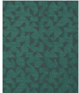
7296 – JASPER: EMERALD