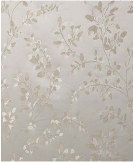
7297 – THEODORE: PLATINUM