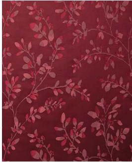
7297 – THEODORE: RUBY