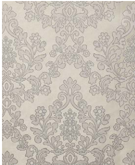
7298 – HUGO: CHAMPAGNE