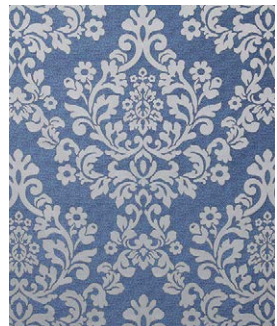
7298 – HUGO: SAPPHIRE