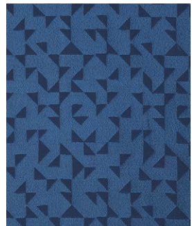
7296 – JASPER: SAPPHIRE