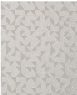
7296 – JASPER: PLATINUM