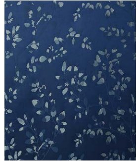
7297 – THEODORE: SAPPHIRE