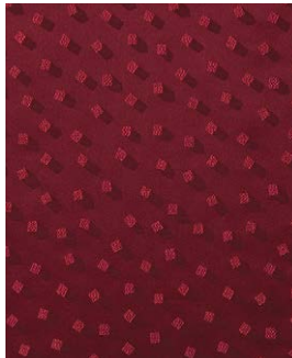
7295 – SILAS: RUBY