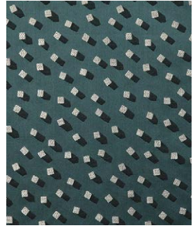
7295 – SILAS: EMERALD