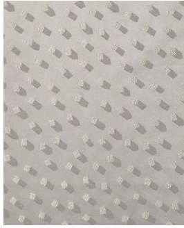
7295 – SILAS: CHAMPAGNE