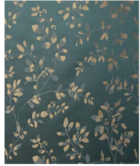
7297 – THEODORE: EMERALD