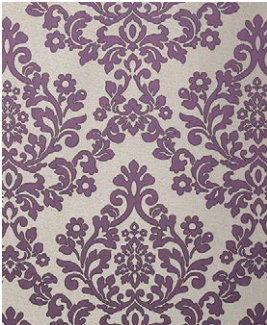
7298 – HUGO: AMETHYST