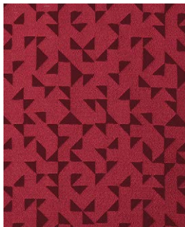
7296 – JASPER: RUBY