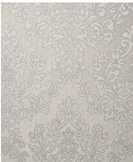
7298 – HUGO: PLATINUM