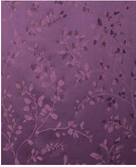
7297 – THEODORE: AMETHYST