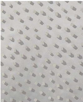
7295 – SILAS: PLATINUM