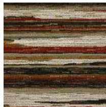
6159 – BARKCLOTH TEAK