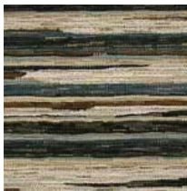
6159 – BARKCLOTH INDIGO