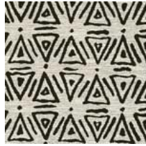
6165 – TAPA EBONY