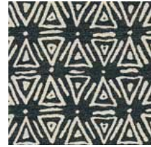
6165 – TAPA INDIGO