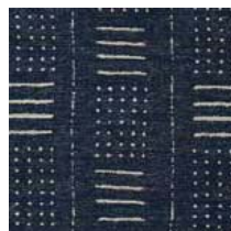
6162 – MUDCLOTH INDIGO