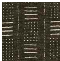
6162 – MUDCLOTH JAVA