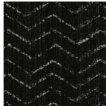
6161 – KIVU EBONY