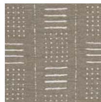
6162 – MUDCLOTH NATURAL