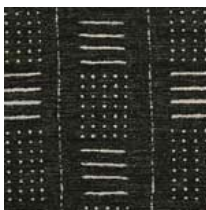
6162 – MUDCLOTH EBONY