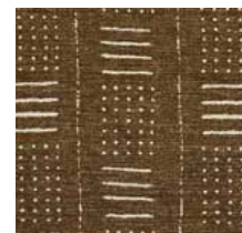
6162 – MUDCLOTH TEAK