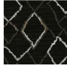
6164 – BENI EBONY