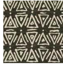
6165 – TAPA GREYSTONE