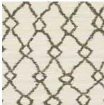
6160 – OURAIN NATURAL