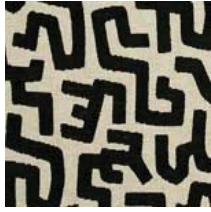
6163 – FINI EBONY