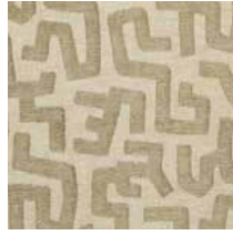
6163 – FINI NATURAL