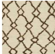
6160 – OURAIN TEAK