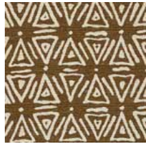
6165 – TAPA TEAK

Pindler’s Exclusive Fusion Collection is a modern global grouping that draws inspiration from traditional artesian cloths. This eclectic collection features designs taken from Moroccan rugs, tapa cloths, mud cloths, and kuba cloths, and reinterprets these centuries’ old traditions with a contemporary vision through the use of novelty yarns and weave structures along with earth tone colors and modern neutrals. The Exclusive Fusion Collection is a selection of seven designs that are exclusive to Pindler.