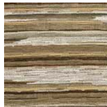
6159 – BARKCLOTH NATURAL