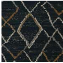
6164 – BENI INDIGO