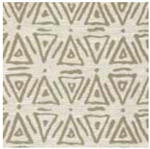
6165 – TAPA NATURAL