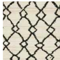
6160 – OURAIN EBONY