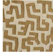
6163 – FINI TEAK