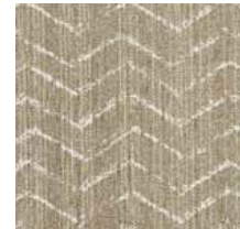
6161 – KIVU NATURAL