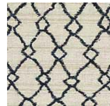
6160 – OURAIN INDIGO