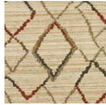
6164 – BENI TEAK