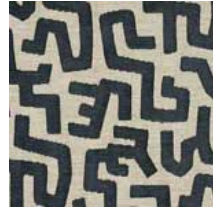
6163 – FINI INDIGO