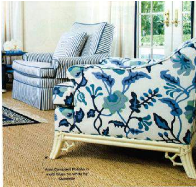
Alan Campbell Potalis in multi blues on white by Quadrille

P. Kaufmann Riva in periwinkle, $20 per yard, fabric.com