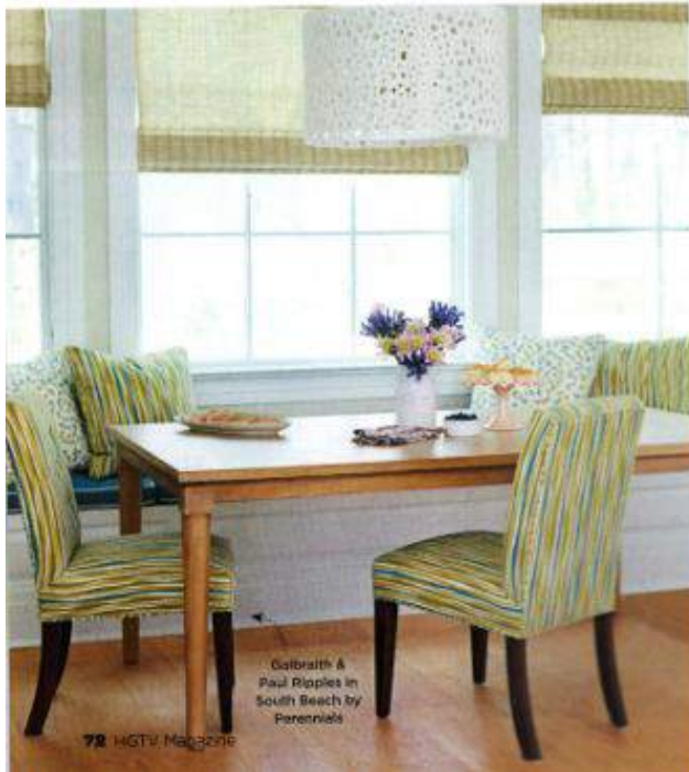
Galbraith & Paul Pipples in South Beach by Perennials